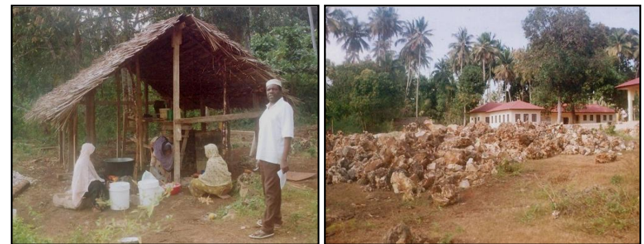
Temporary kitchen for 500 pupils (left) and construction site of the future community hall with a kitchen and a dining hall (right)